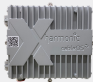
Shell R-PHY Node