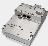
Pebble R-PHY Device

Turnkey deployments simplify operations to leverage existing infrastructures and minimize hardware investment. The entire solution is built to work with third-party components and is industry standard compliant.