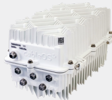
Ripple R-PHY Node