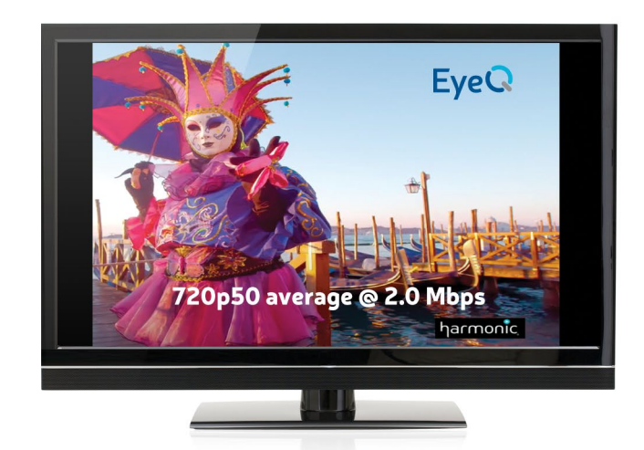
EyeQ allows you to deliver consistently high-quality video with a 50% reduction in bitrate.